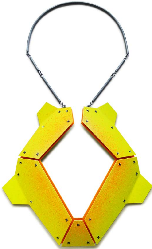
1. Linnéa Eriksson, Connect , 2016